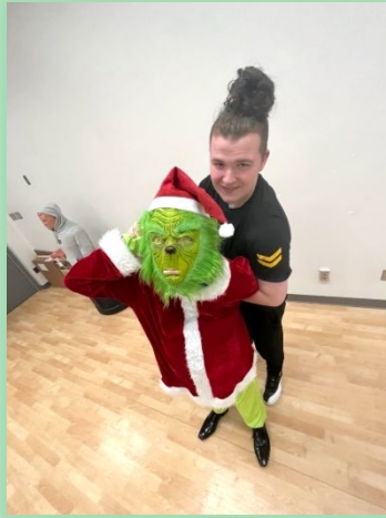
This Criminal Justice student demonstrated proper handcuffing techniques while foiling the Grinch's sneaky plans.

C 4 will connect community resources to provide career education for all students while laying the foundation for life-long learning. www.bcscschools.org/C4 @ConnectionsC4