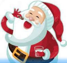
Students in PLTW Human Body Systems are studying the digestive system. In the spirit of the season, instead of creating "traditional" anatomy drawings, they decided to have an ugly sweater contest to illustrate the path of Santa's treats.