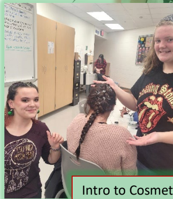
Intro to Cosmetology classes created holiday up-dos to practice for their finals. Creativity was on full display as they incorporated glitter, ribbons, pom poms, and many other festive items!