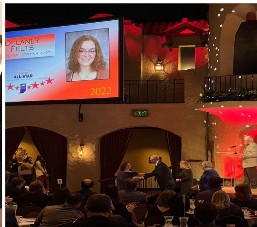
Awards ceremony at State HOSA conference