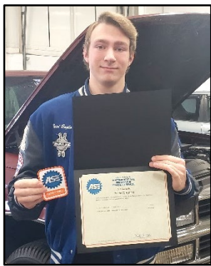
Reed England CSA (12)

C 4 students recognized by the National Institute for Automotive Services Excellence