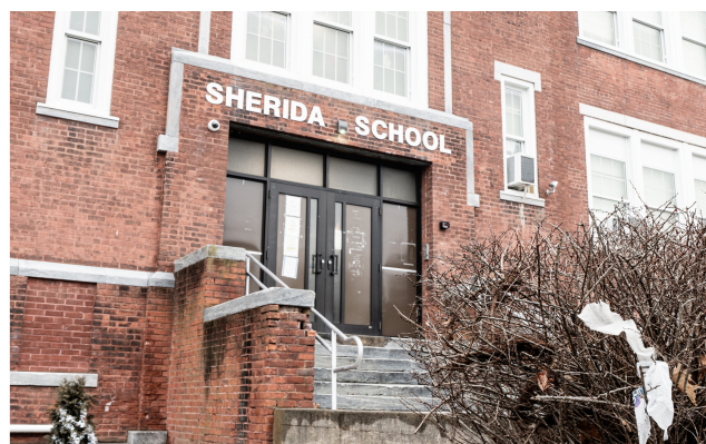
BRIDGEPORT LEARNING CENTER

HARDING SCHOOL, 379 Bond St, Bridgeport, CT 06610