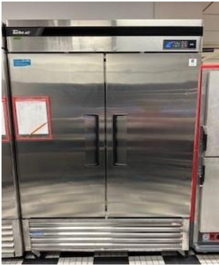
Turbo Air 2 Door Freezer Model # TSF-49-SD-N 54 X 30 X 83