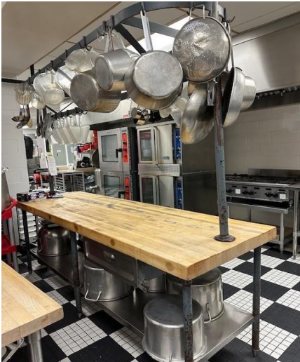
Butcher Block Table with Overhead Hangers & Shelf 96 X 30 X 36 (Items on shevles/table/hanging not included)