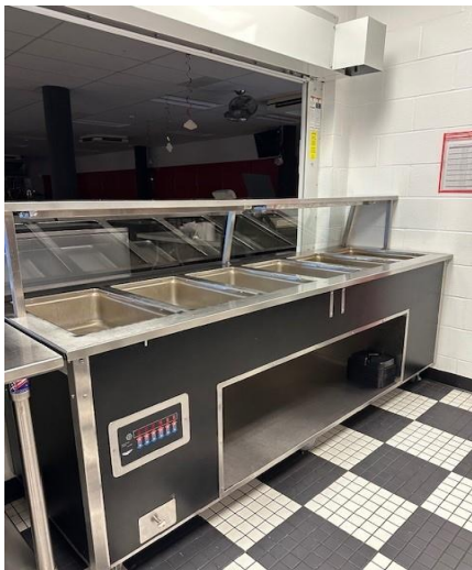
Vollrath Hot Well Serving Line with Top Shelf (6 Hot Wells) Model # 98888-0002-CFF 88 X 28 X 35