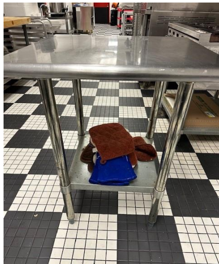
Metal Table 24 x 24 x 36 (Items on shelves not included)