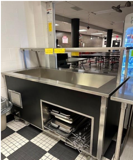
Vollrath Cold Well Serving Cabinet with Top Shelf Model # 37065-000002-CFA 60 X 28 X 35