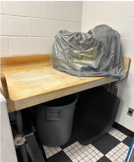
Butcher Block Table 48 X 30 X 40 (Items on & under table not included)