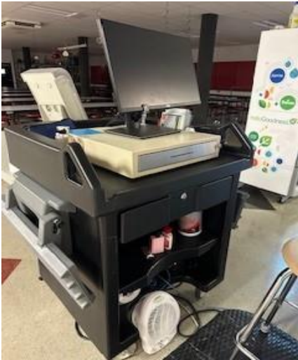
Cambro Cashier Cart with Side Rails and Drawer 32 X 30 X 41 (Items on cart not included)