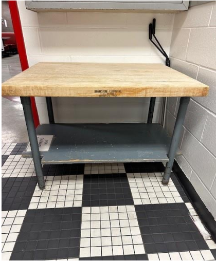
Butcher Block Table with Shelf 36 X 30 X 30