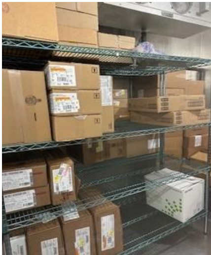
Metal Shelving 60 X 21 X 63 (Items on shevles not included)