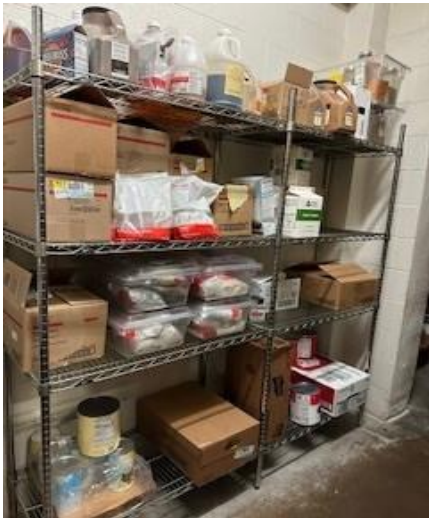
Metal Shelving 94 X 18 X 74 (Items on shevles not included)