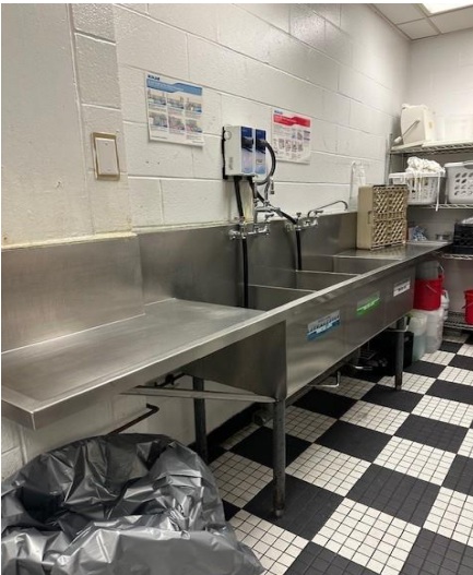
Three Compartment Sink with Tables 132 X 24 X 38 (Items on & under table not included)