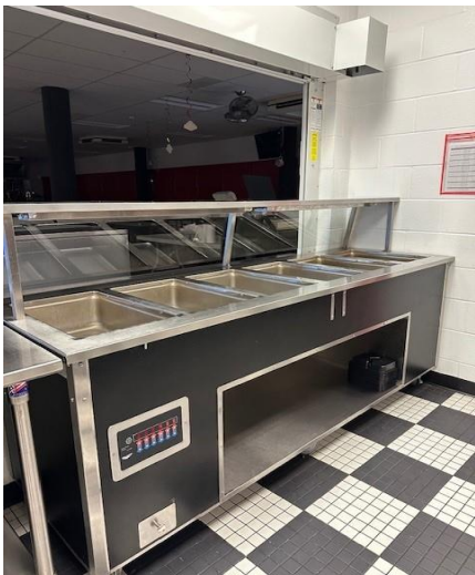
Vollrath Hot Well Serving Line with Top Shelf (6 Hot Wells) Model # 98888-0002-CFF 88 X 28 X 35