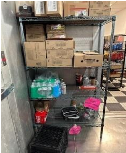
Metal Shelving 35 X 18 X 63 (Items on shevles not included)