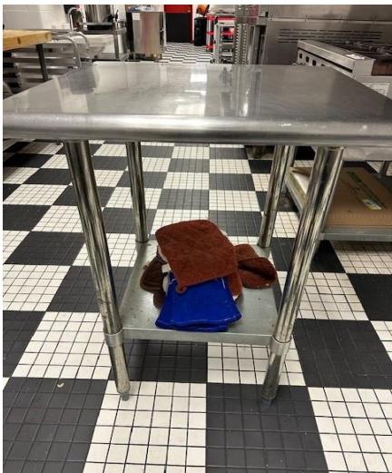
Metal Table 24 x 24 x 36 (Items on shelves not included)