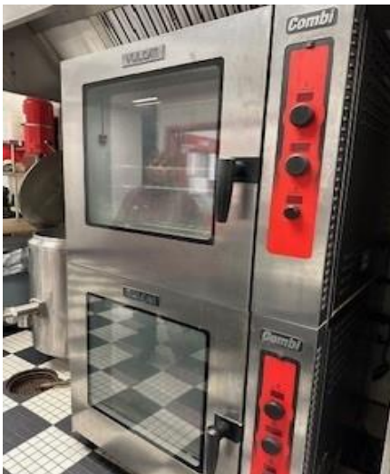
Vulcan Combi Oven Model # ABC 7G-NAT 42 X 39 X 68