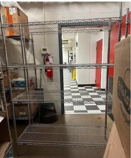
Metal Shelving 35 X 18 X 74 (Items on shevles not included)