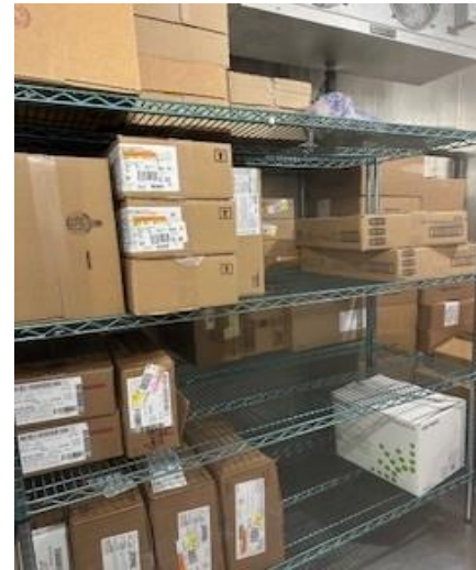
Metal Shelving 60 X 21 X 63 (Items on shevles not included)