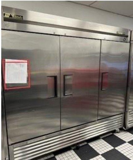
True 3 Door Freezer Model # T1-T7F 78 X 30 X 83