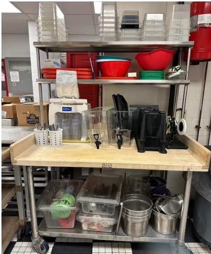
Butcher Block Table with Shelves 48 X 31 X 38 (Items on shelves/table not included)