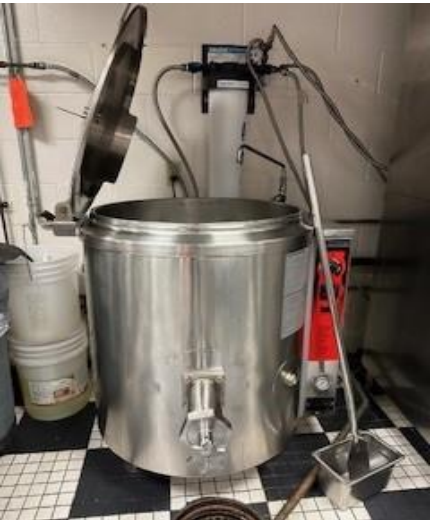
Vulcan Steam Kettle (40 Gallons) Model #K40GL Serial # 46-3017364