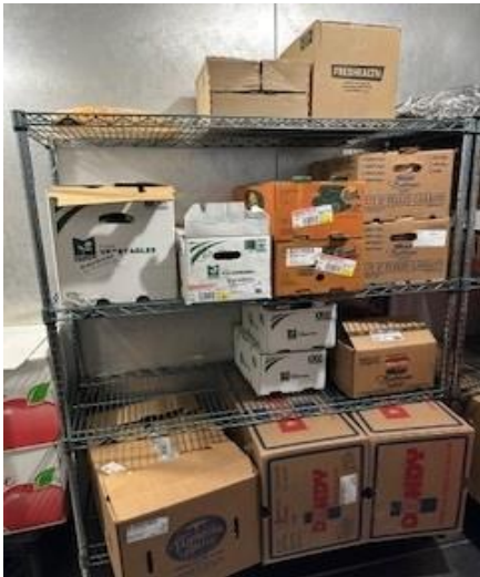
Metal Shelving 47 X 18 X 63 (Items on shevles not included)