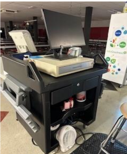
Cambro Cashier Cart with Side Rails and Drawer 32 X 30 X 41 (Items on cart not included)