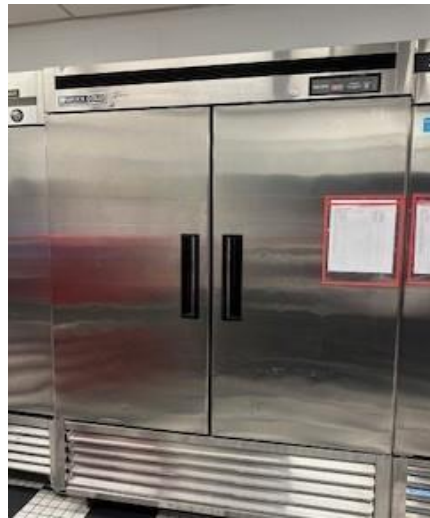
Max Cold 2 Door Refrigerator Model # MCR-49-FDRE 54 X 31 X 83