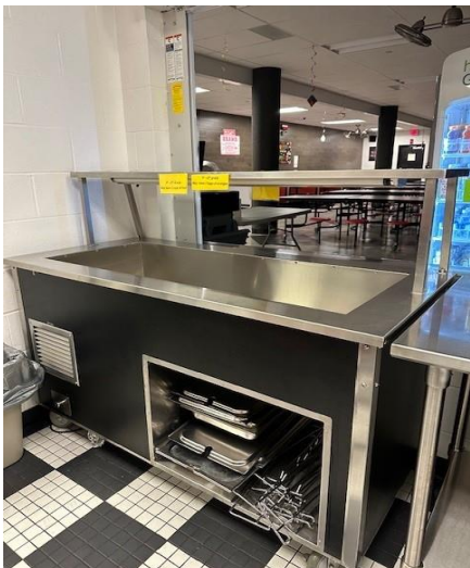
Vollrath Cold Well Serving Cabinet with Top Shelf Model # 37065-000002-CFA 60 X 28 X 35