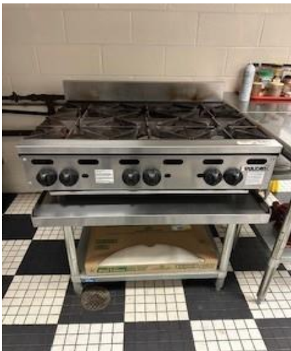
Vulcan Stove Top Model # VHP 636-1 Serial # 650132594 36 X 32 X 37