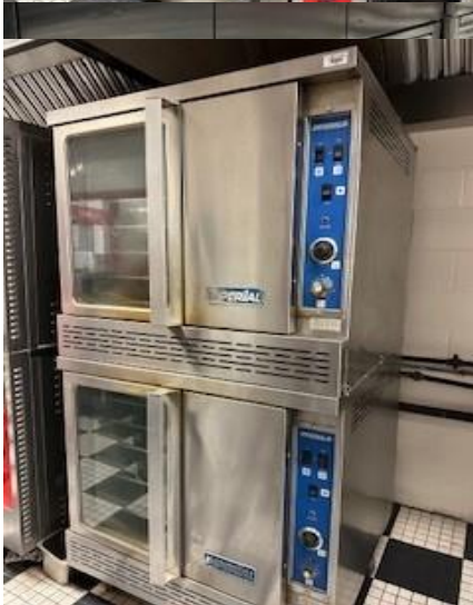
Imperial Oven 38 X 36 X 68