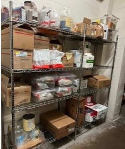
Metal Shelving 94 X 18 X 74 (Items on shevles not included)