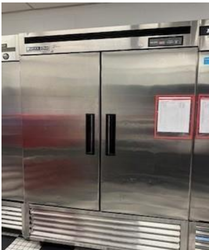
Max Cold 2 Door Refrigerator Model # MCR-49-FDRE 54 X 31 X 83