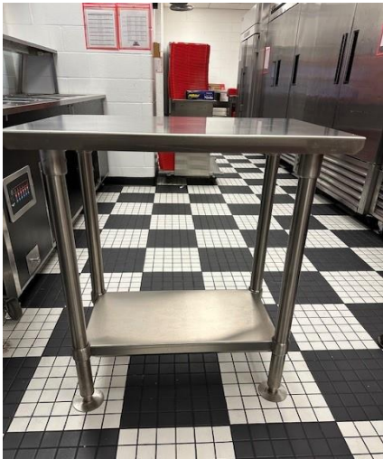
Metal Table 18 X 28 X 34