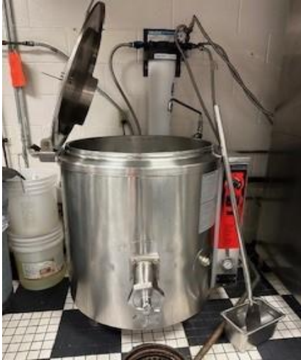
Vulcan Steam Kettle (40 Gallons) Model #K40GL Serial # 46-3017364