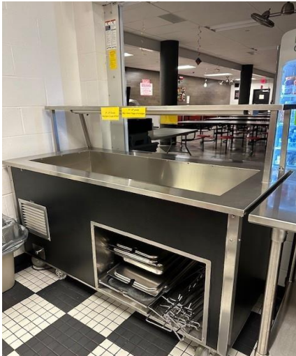
Vollrath Cold Well Serving Cabinet with Top Shelf Model # 37065-000002-CFA 60 X 28 X 35