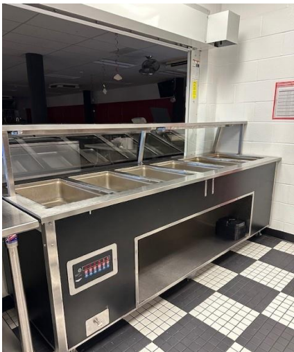
Vollrath Hot Well Serving Line with Top Shelf (6 Hot Wells) Model # 98888-0002-CFF 88 X 28 X 35