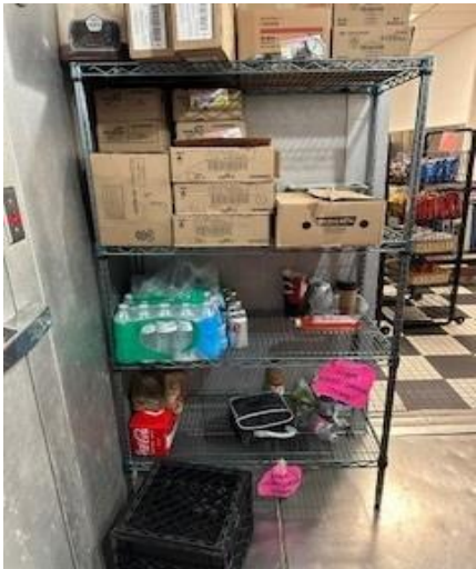
Metal Shelving 35 X 18 X 63 (Items on shevles not included)