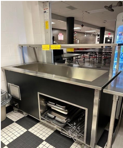
Vollrath Cold Well Serving Cabinet with Top Shelf Model # 37065-000002-CFA 60 X 28 X 35