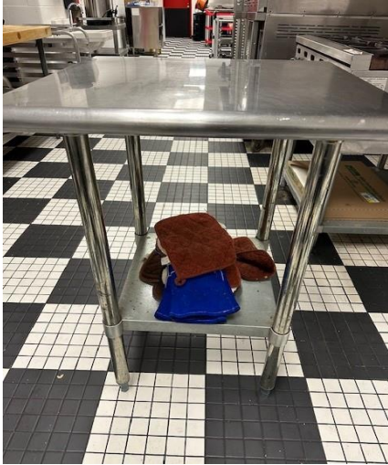
Metal Table 24 x 24 x 36 (Items on shevles not included)