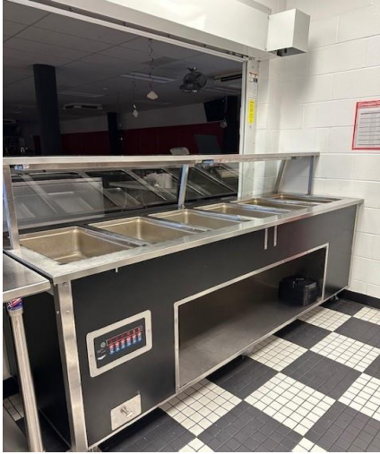
Vollrath Hot Well Serving Line with Top Shelf (6 Hot Wells) Model # 98888-0002-CFF 88 X 28 X 35