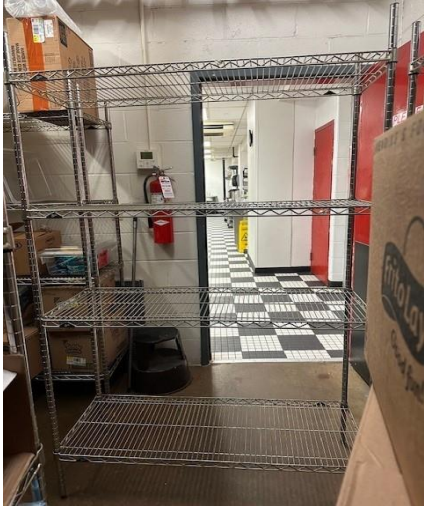
Metal Shelving 35 X 18 X 74 (Items on shevles not included)