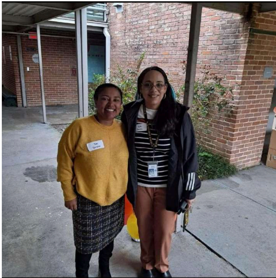
Abney Elementary Information & PTA Page