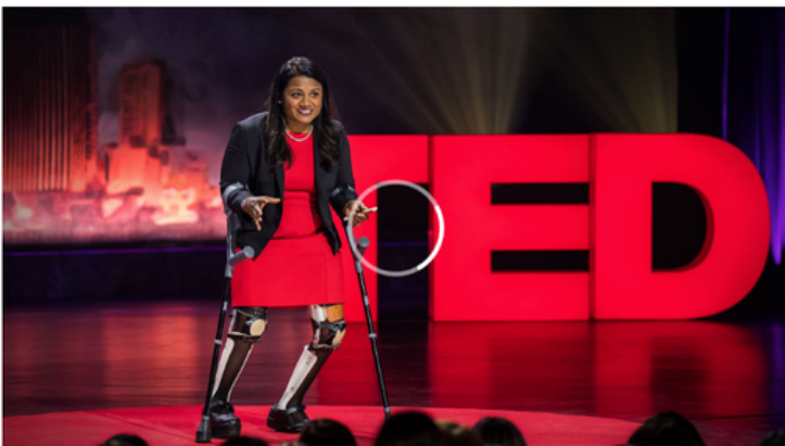
What I learned when I conquered the world's toughest triathlon

She continues to push boundaries and inspire others and recently wrote a book entitled The Girl Who Figured It Out! She will be speaking at the North Spokane County Library on March 10 at 2pm. I will be bringing my girls, for sure!