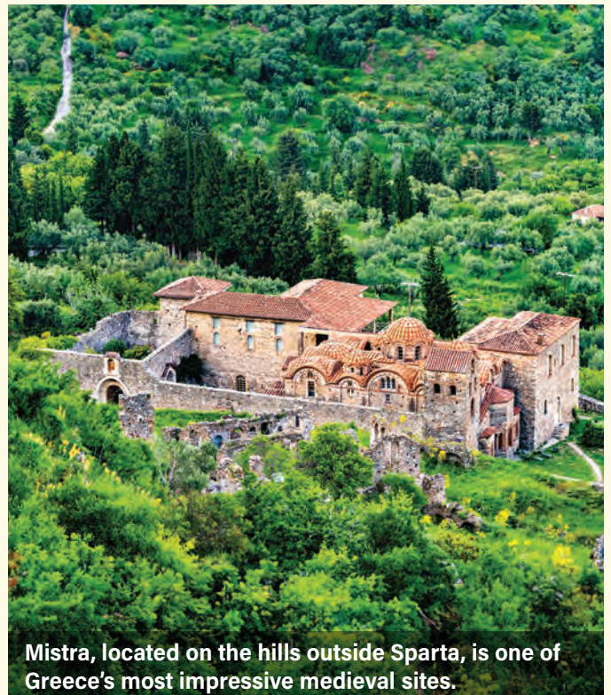
Mistra, located on the hills outside Sparta, is one of Greece's most impressive medieval sites.