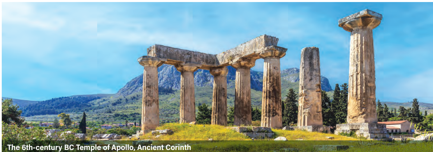
The 6th-century BC Temple of Apollo, Ancient Corinth

Since antiquity, olive trees have been cultivated in the area around Sparta—both for their fruit and for their oil. Today, the production of oil predominates, taking full advantage of the region's exceptional natural environment and ideal weather conditions. We will visit an