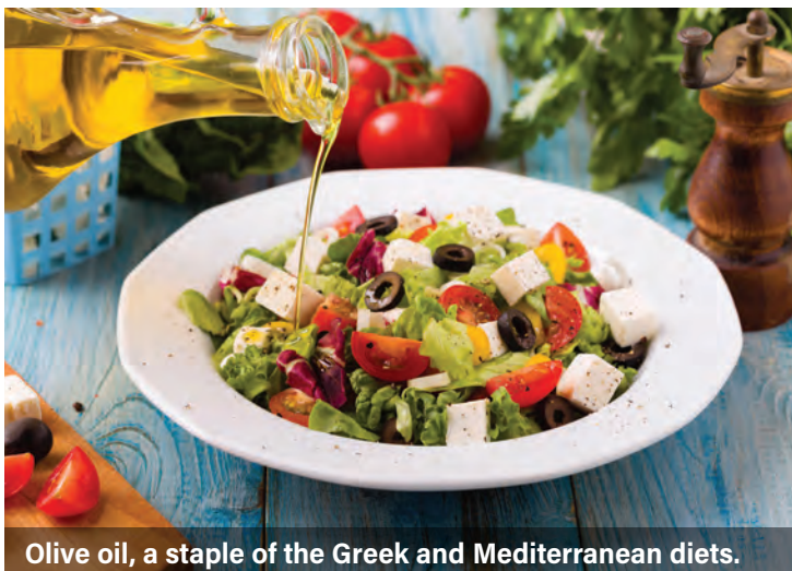
Olive oil, a staple of the Greek and Mediterranean diets.

Today we explore the Mani Peninsula, a mountainous and arid region