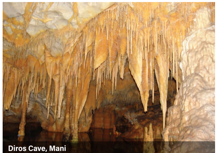
Diros Cave, Mani