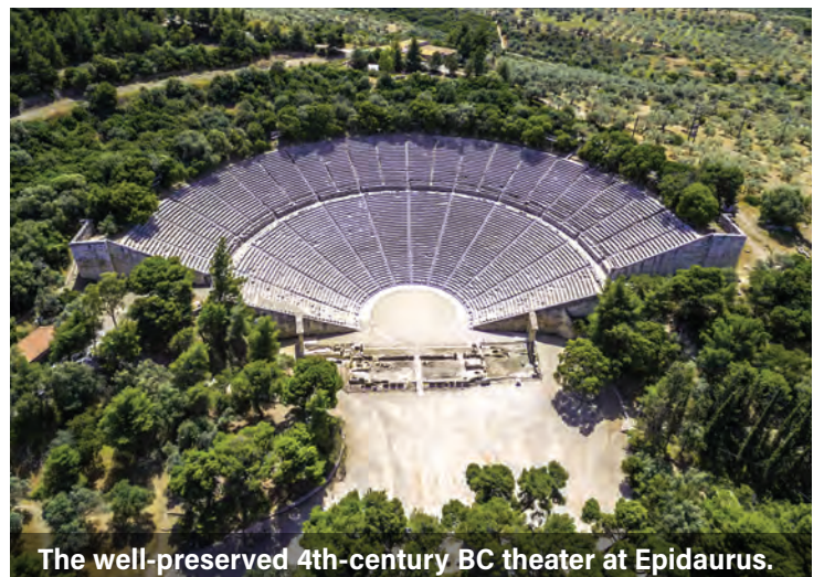
The well-preserved 4th-century BC theater at Epidaurus.

Walk to the airport's departures terminal across the street from the hotel for flights homeward. (B)