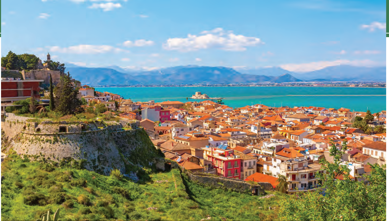
Nafplion, one of Greece's loveliest old towns.

of mountain villages of distinctive stone houses, where the inhabitants pride themselves on being descended from the ancient Spartans. Enjoy lunch at the fishing village of Limeni, visit magnificent Diros Cave, with its underground lake and spectacular display of stalactites and stalagmites, and stop in Areopolis, a typical Maniot town and the region's capital. (B, L, D)