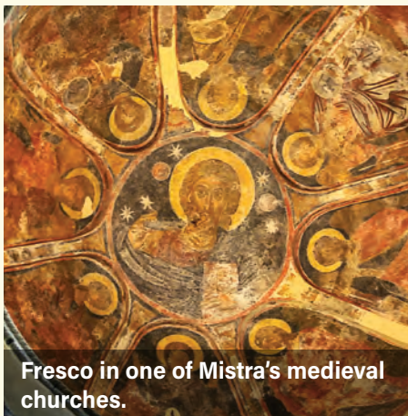
Fresco in one of Mistra's medieval churches.