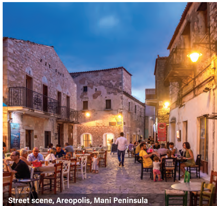
Street scene, Areopolis, Mani Peninsula