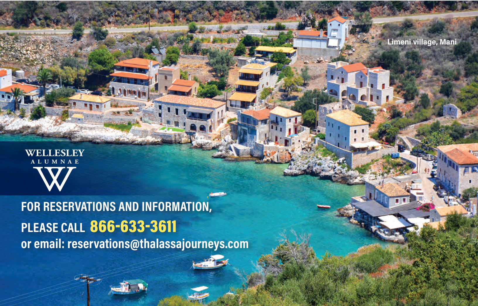
Limeni village, Mani