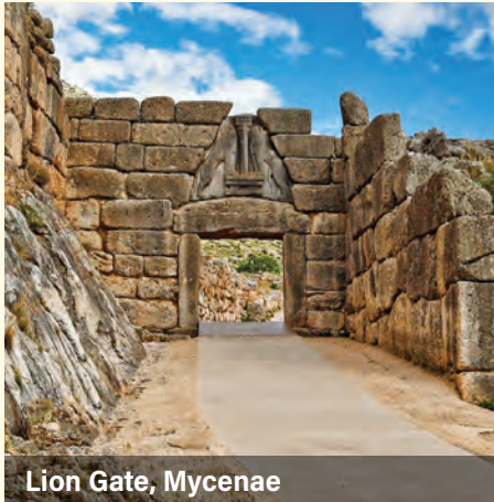
Lion Gate, Mycenae

NOT INCLUDED: Airfare, travel insurance, expenses of a personal nature; any meals and other items not mentioned in the itinerary and the Program Inclusions.