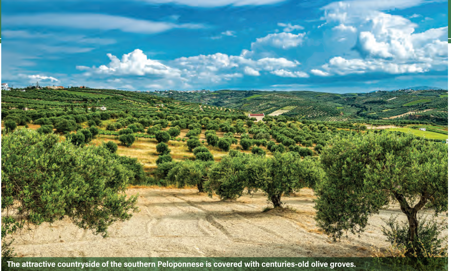
The attractive countryside of the southern Peloponnese is covered with centuries-old olive groves.

organic olive farm where we will meet with the owner and participate in the harvest. During this hands-on experience we will learn much about sustainable organic methods of cultivation and will have an opportunity to sample some olive oils, Kalamata olives, and other olive-based products. (B, L, D)