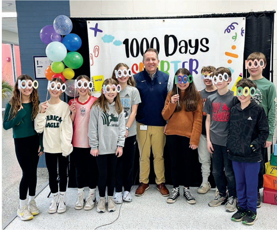
A group of 5th grade students pose with Superintendent Dana Addis on their 1,000th day of school.

Students also wrote a letter to their future selves for 1,000 days from now, when they are juniors in high school.