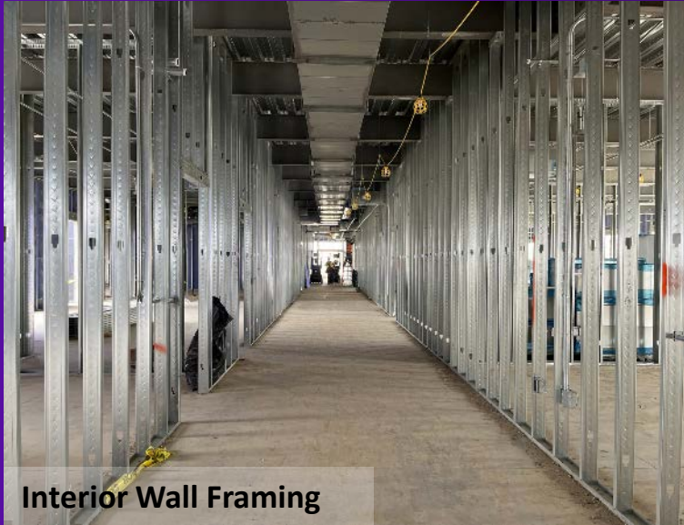
Interior Wall Framing