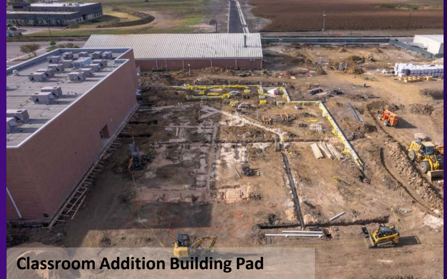
Classroom Addition Building Pad