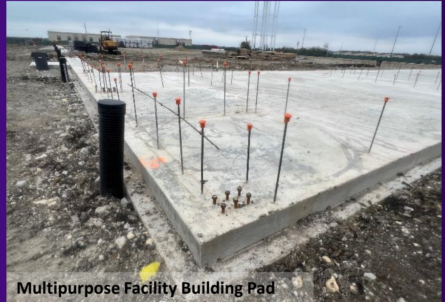
Multipurpose Facility Building Pad