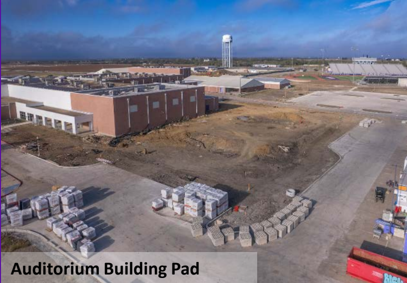
Auditorium Building Pad

Cafeteria, Classroom and CTE Additions, New Auditorium, and Multipurpose Facility