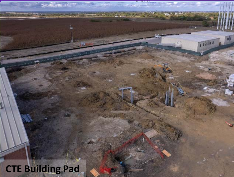
CTE Building Pad