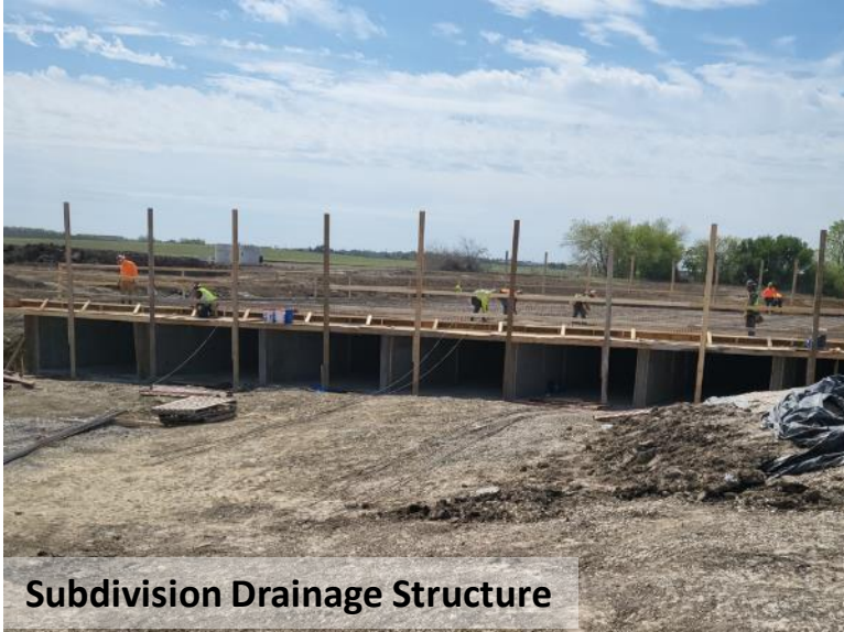
Subdivision Drainage Structure