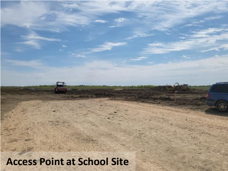
Access Point at School Site