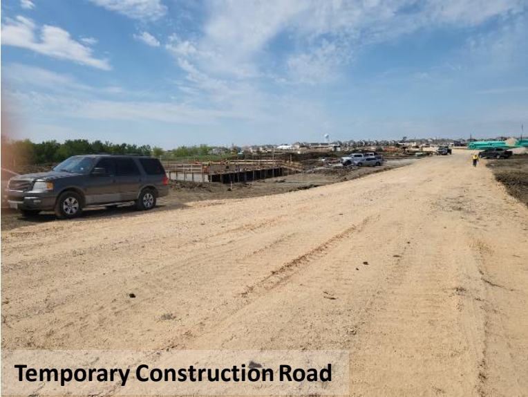
Temporary Construction Road