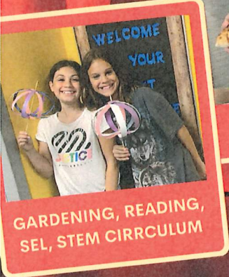
GARDENING, READING, SEL, STEM CIRRCULUM

$5.00 AN HOUR, MAX OF $29.00 A DAY MOST FAMILIES QUALIFY FOR REDUCED RATES