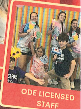
ODE LICENSED STAFF