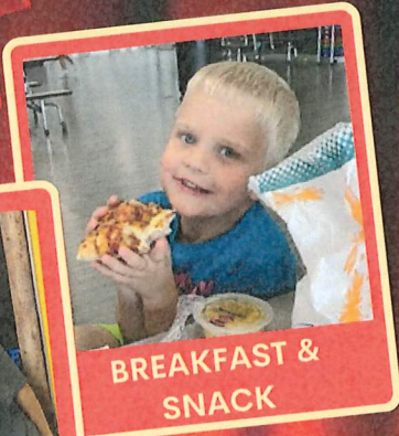
BREAKFAST & SNACK