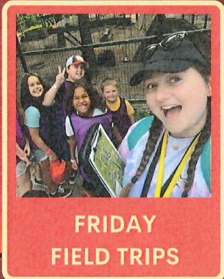
FRIDAY FIELD TRIPS