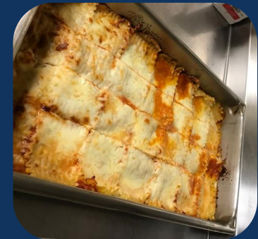
Cheese Lover's Day