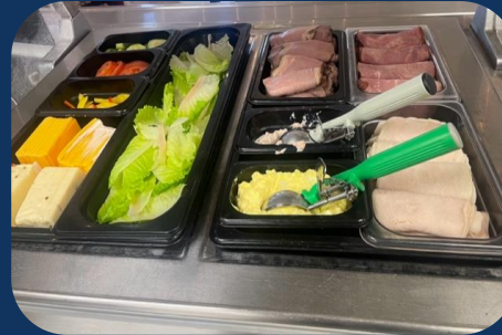
Native American Heritage Month