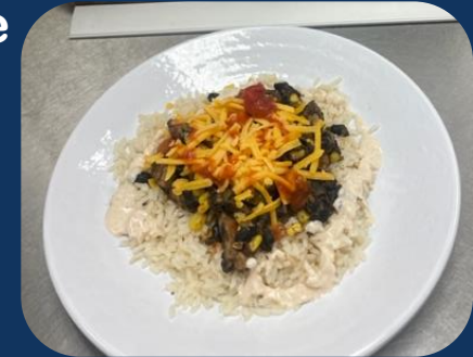
Latin Heritage Month