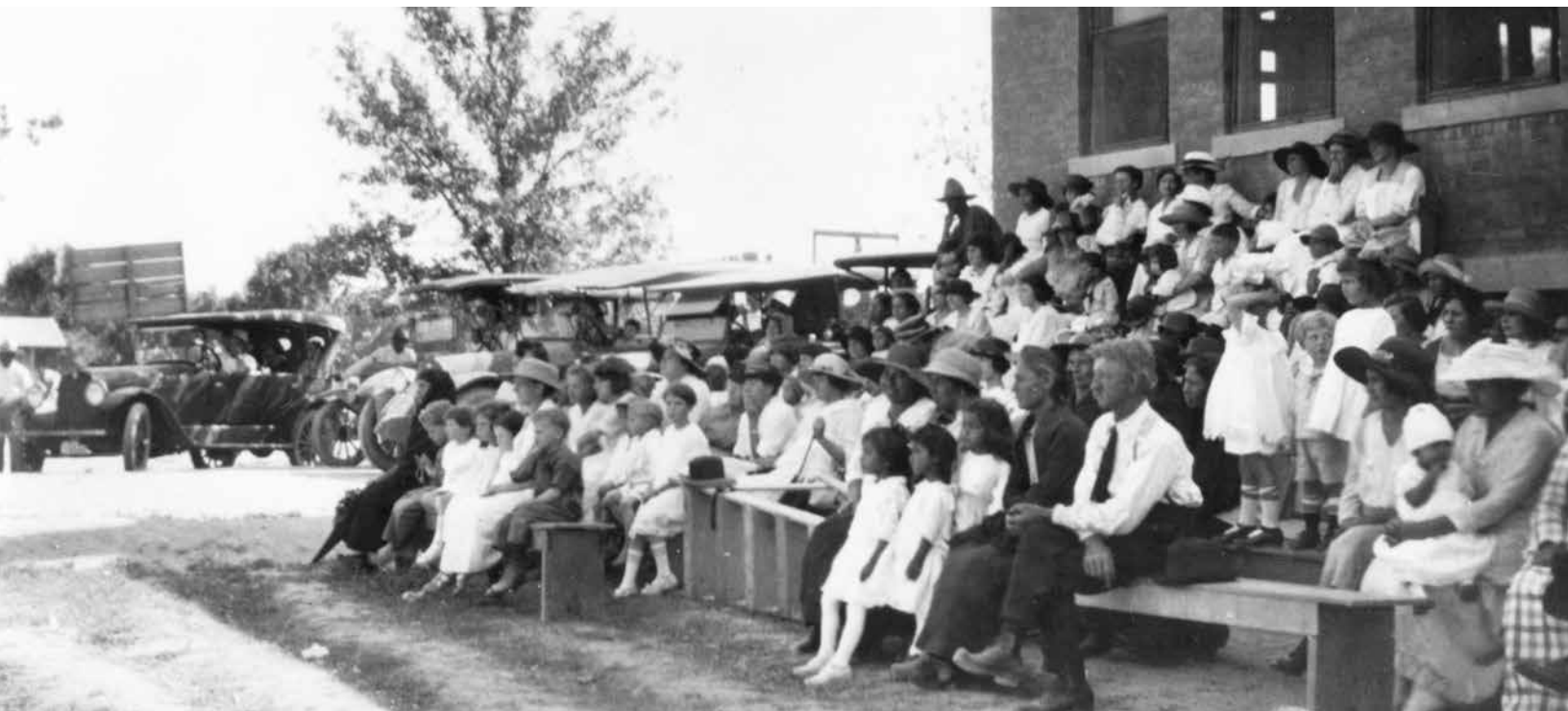
Graduation day, Little Red Schoolhouse, 1912

5 Source: Arizona weekly citizen, December 26, 1896 furnished by the Arizona State Library, Archives and Public Records; Phoenix, AZ: https://chroniclingamerica.loc.gov/lccn/sn82015133/1896-12-26/ed-1/seq-1/