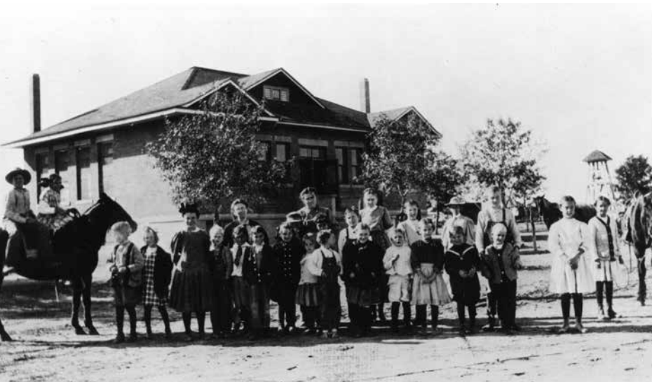
Scottsdale Unified School District's Little Red Schoolhouse, opening day, 1910