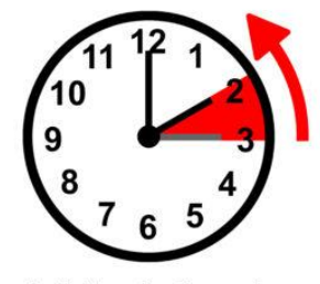
daylight saving time ends

Daylight saving time is ending Sunday, November 1. Don't forget to set your clocks back