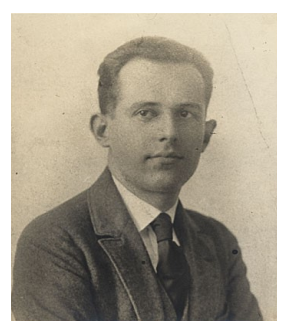
Philip Trammell Shutze 1890—1982

This month's Curiosity Corner focuses on a photograph of the North Avenue Elementary School building (now the Teaching Museum South ) in Hapeville. It is the oldest Fulton County Schools building still in operation; and was designed in 1928 by Philip Trammell Shutze , architect of the historic Swan House located at the Atlanta History Center . Built in the classicalist style, the building's original brick veneer, wood floors and a few palladium windows remain much as they did when classes began in September of 1929.