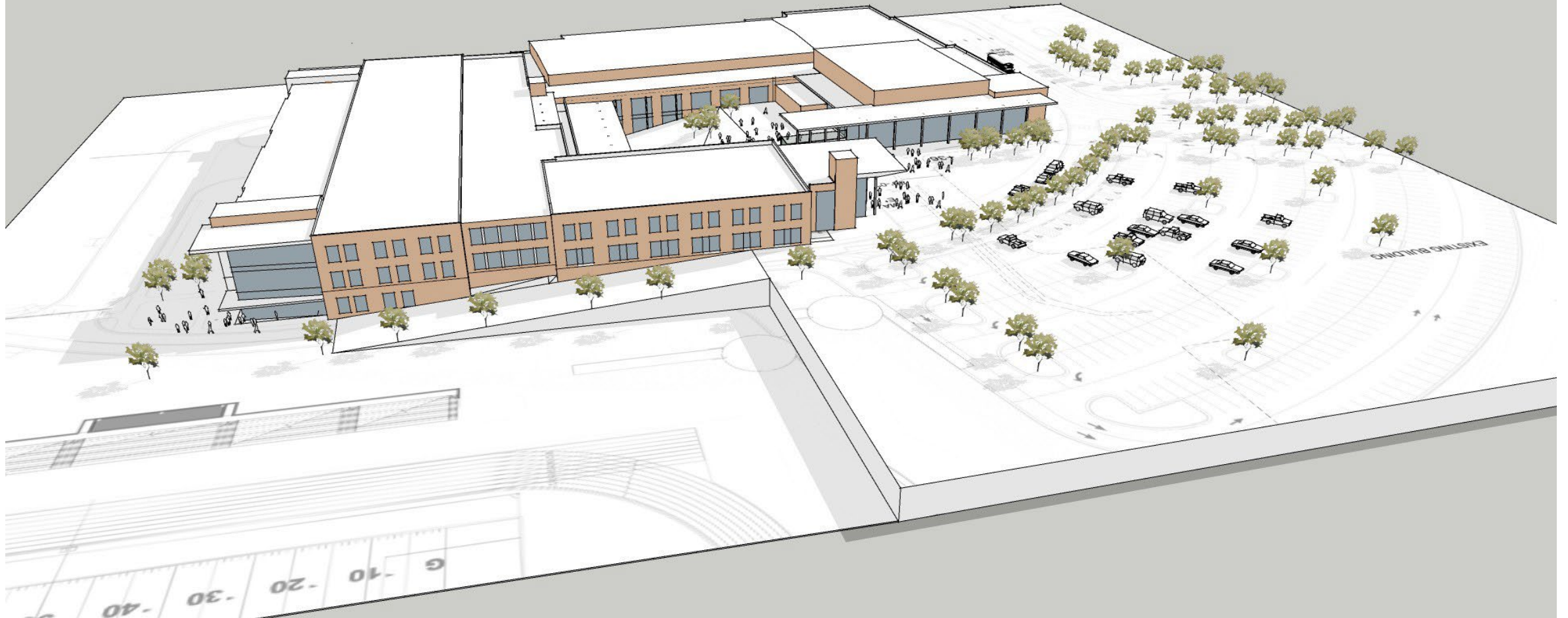
View Looking South Over Football Field