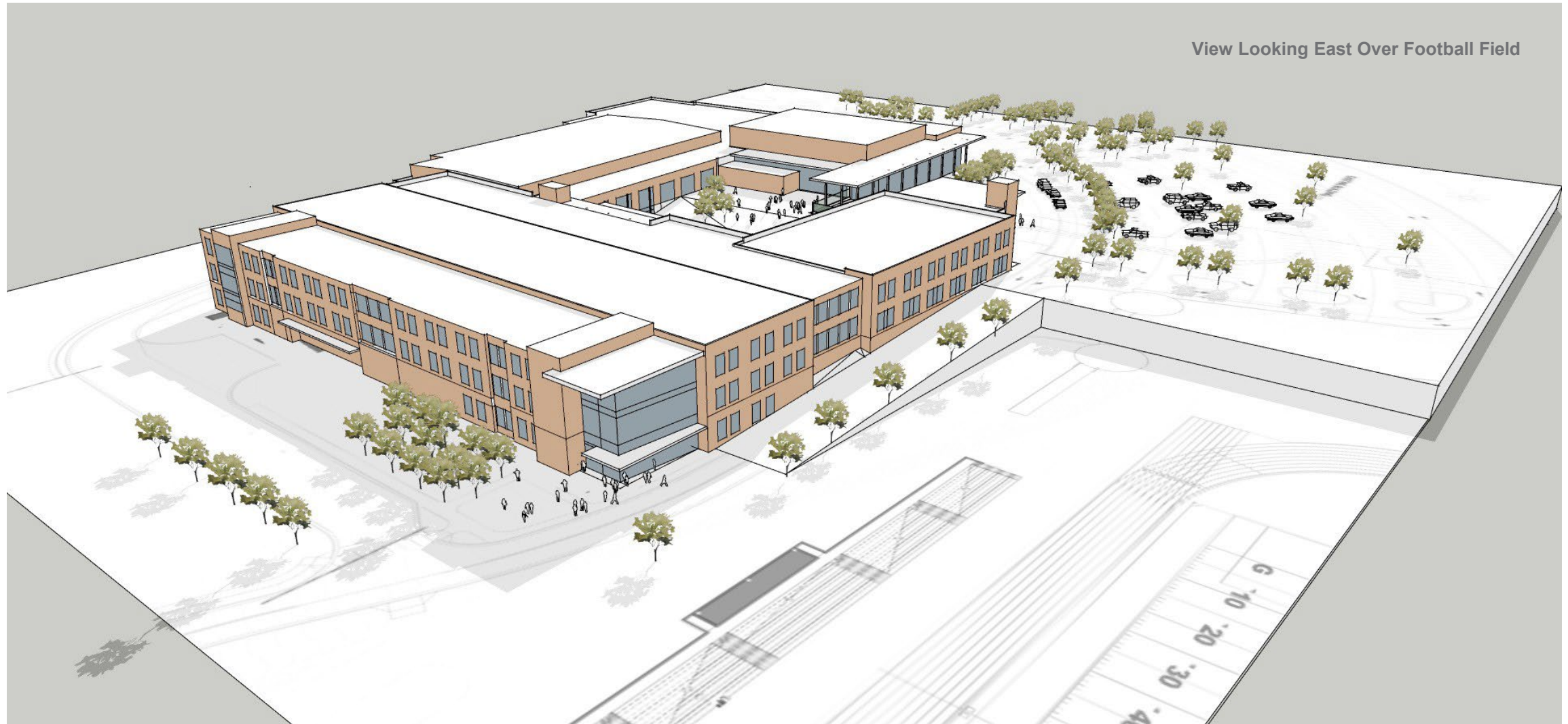
View Looking East Over Football Field