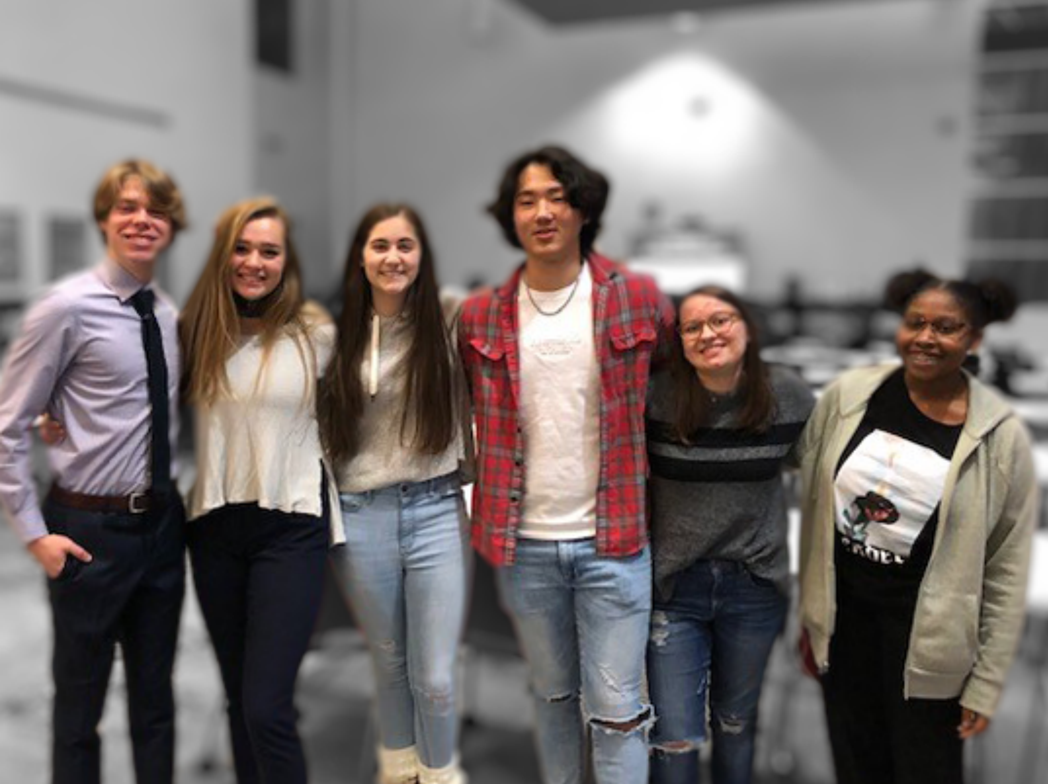
Diploma Programme Class of 2020