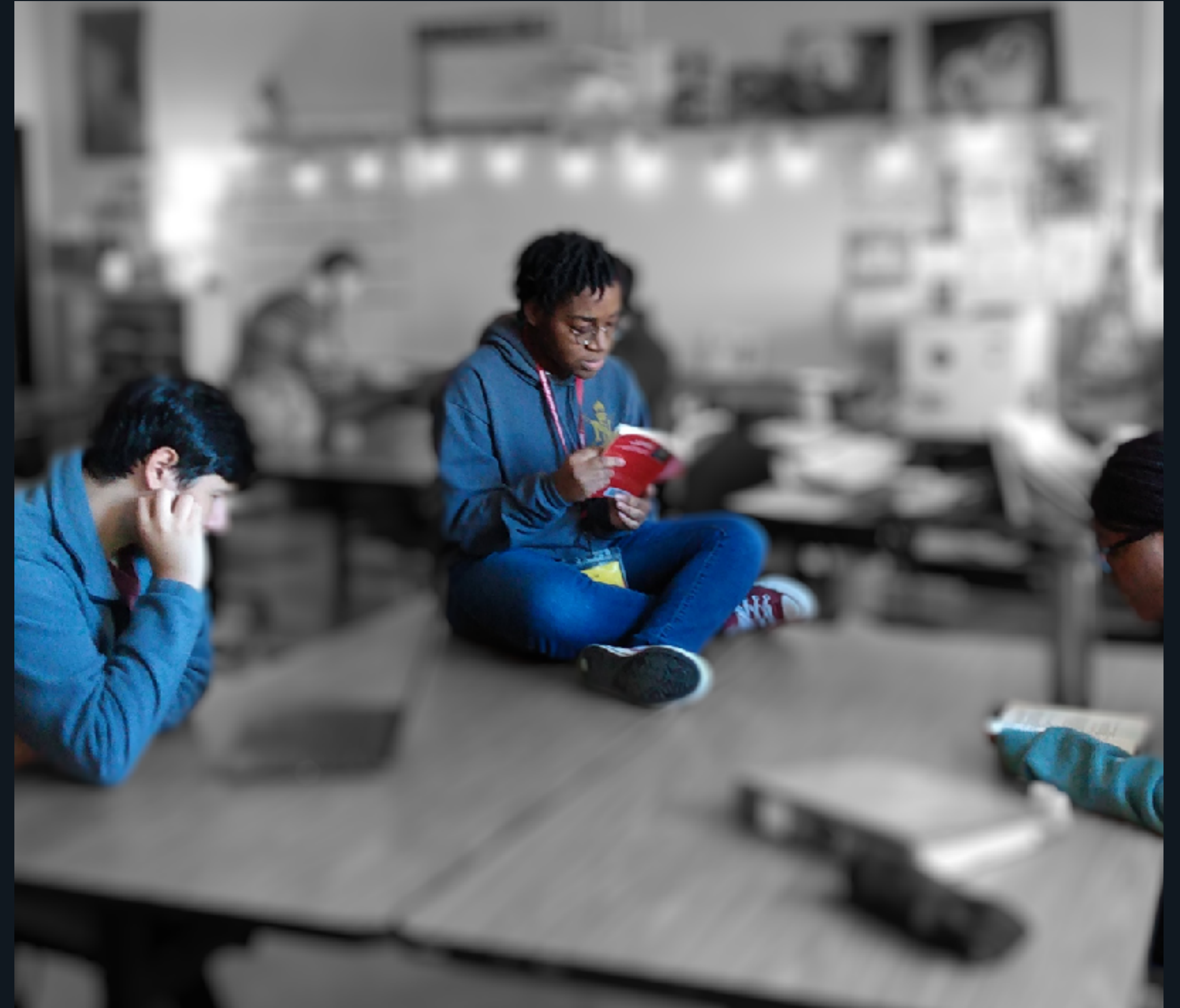
IB Literature & Performance SL