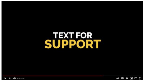
Text4Help- Fulton County Schools Student PSA Video Learn More About Text4Help Here