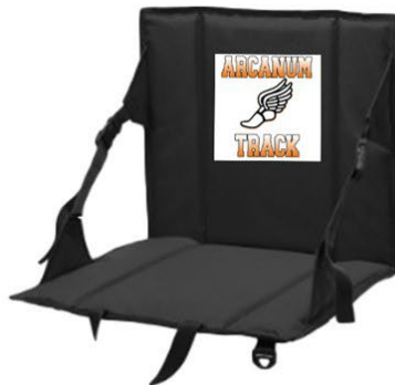
Padded stadium seat—$35.00