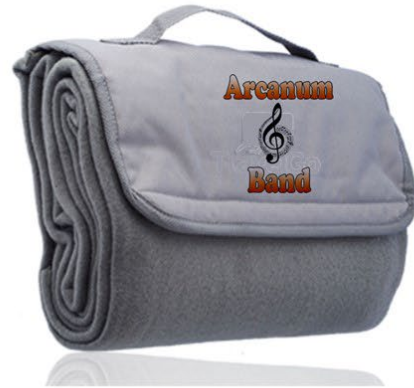
6 ft. x 12 ft. fleece blanket—in black or Grey—$ 30.00