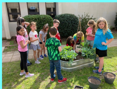
Garden Club spruced up our outdoor garden.