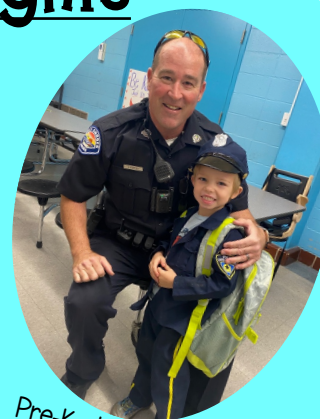
Pre-K studied about community helpers.