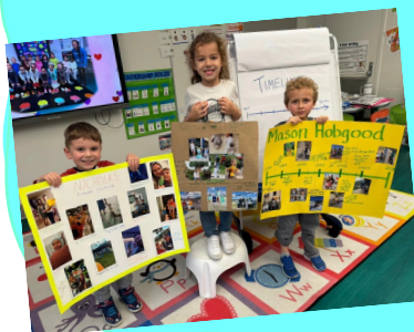
Kindergarten & 2 nd grade completed timelines.