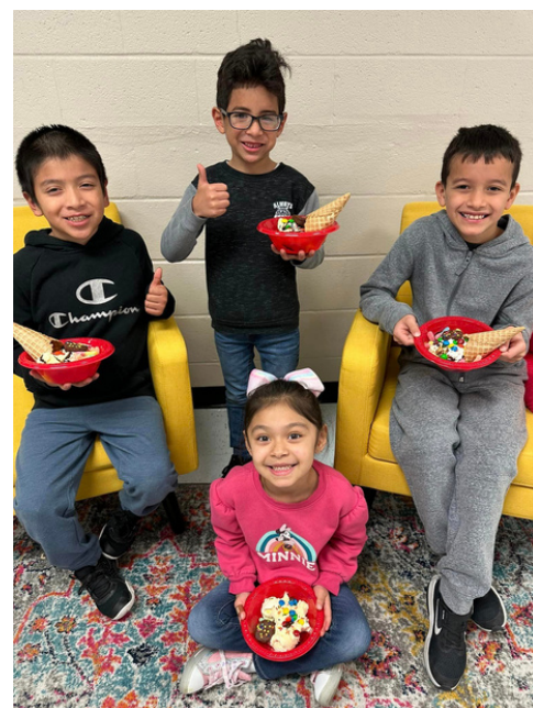
Above: Gadsden Elementary School finished ACCESS testing and threw a party featuring sundaes.

It's not too early for you gardeners to start planning to attend the annual plant sale scheduled for the FFA Greenhouse on April 20 from 8:00 a.m. to 1:00 p.m. Students have been filling pots and transplanting varieties of growing things for a few weeks now in preparation to get your home décor off to a great start.