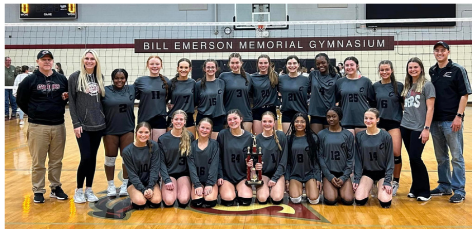
Above: The Crockett County Middle School Lady Cavaliers sailed through their own invitational tournament with a 4-0 record to win the championship.

But there are a number of other things scheduled for this month that aren't sports-related.