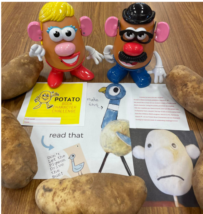
Above: Maury City Elementary will be displaying its Potato Head Book Characters at its Math & Literacy Night Thursday from 5:30 to 7:00 at the school.