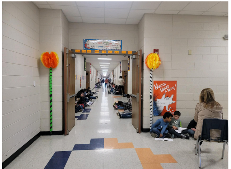
Right: Friendship Elementary School students recently celebrated DEAR Day - Drop Everything and Read - by going out in the halls with a book. FES Accelerated Reader students covered more than a million words in just 20 days in February.