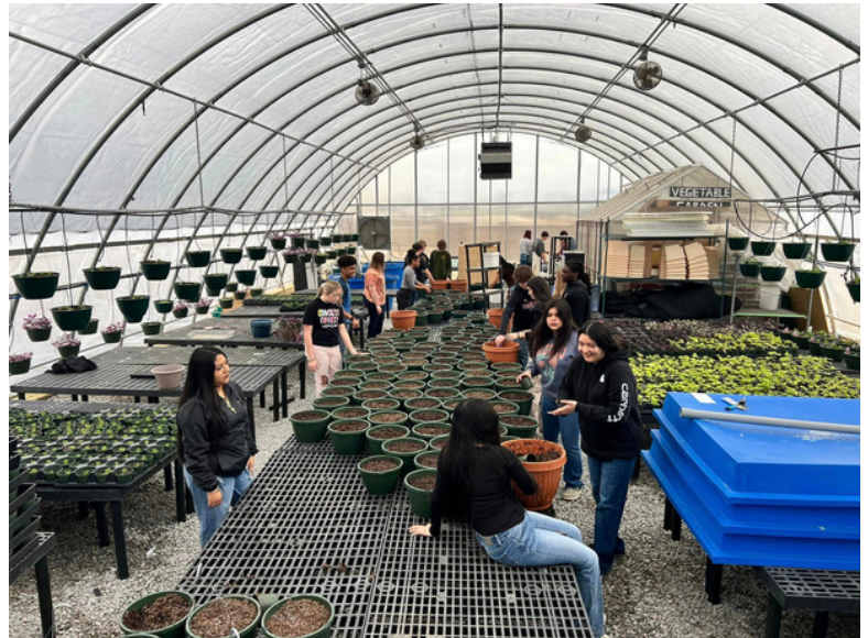
Below: Students in the FFA Greenhouse are busily preparing for the annual plant sale April 20