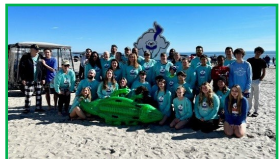
2023 Polar Plunge Participants