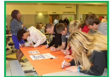
Students Sign “STOMP Out Bullying” Pledge

Archery Team Basketball, Football, and Cheer Active Participation in Socastee High School Sports Polar Plunge Spirit Week, Red Ribbon Week, Holiday Caroling, and Charitable Giving Book Fair, Book Club, Battle of the Books Fellowship of Christian Athletes Spirit Weeks/Dress-Up Days for Athletics, Holidays, and More