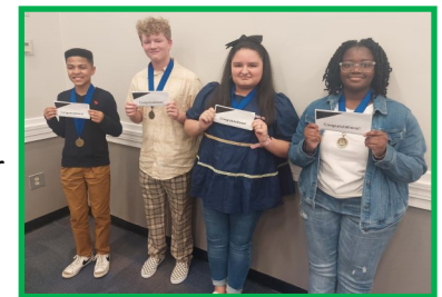
National History Day Qualifiers

Guidance Department Red Ribbon Week Activities STOMP Out Bullying Events Drinking and Driving Curriculum HTC Reel Kids—Recognition for Students Excelling Despite Significant Challenges Second Steps Social-Emotional Learning Curriculum