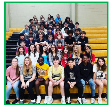
FMS Athletes on Spring Socastee High Teams