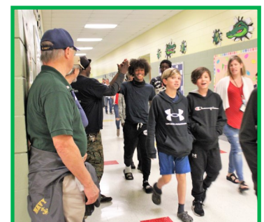
High-Five Line for Guests of Honor on Veterans Day

MakerSpace Junior Beta Yearbook Staff National Junior Art Honor Society Robotics Technology/Rubik’s Club