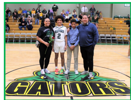
2023 Basketball Parents' Night