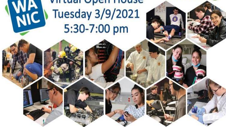
Career & Technical Education opportunities for high school students

Bellevue School District offers, on our campuses: Culinary Arts and Advanced Culinary Arts at Newport; CISCO Academy CCNA and CISCO CCNP at Newport; Automotive Technology 1 and 2 at Bellevue, Health Science Careers at Sammamish, and NEW this year Building Industry Technology-Core Plus Construction at Interlake High School. Come join the fun! All students can register for these classes!