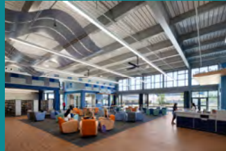
Casa Roble High School Student Union and Administration