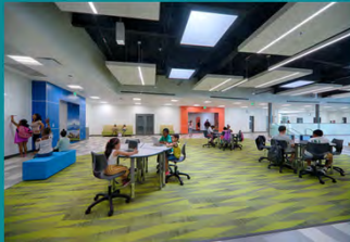
Dyer-Kelly Elementary School