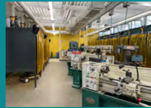
Rio Americano High School CTE