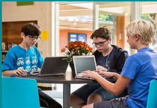
Unschool Alternative Learning Center