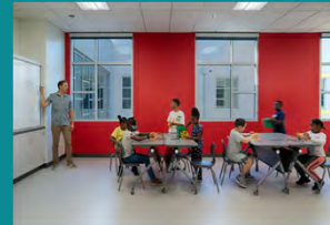
Dyer-Kelly Elementary School