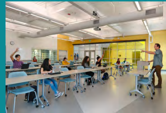
Mira Loma Science Building