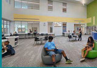
Arden Middle School