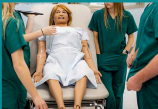
Rio Americano High School CTE