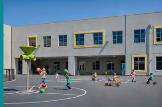
Dyer-Kelly Elementary School