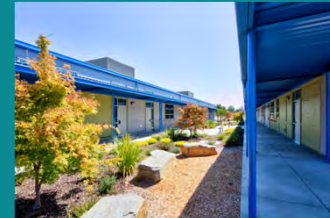
Greer Elementary School