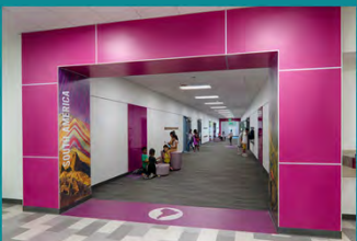
Dyer-Kelly Elementary School