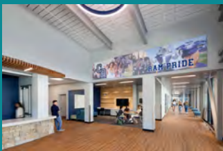
Casa Roble High School Student Union and Administration