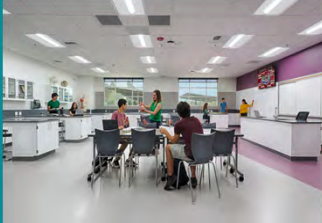
Mira Loma Science Building