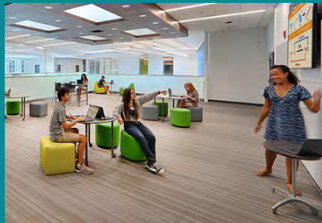
Arden Middle School