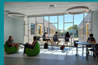
Arden Middle School