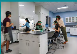
Mira Loma Science Building