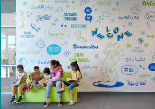
Dyer-Kelly Elementary School