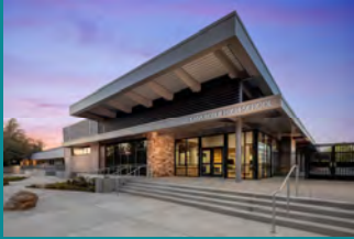
Casa Roble High School Student Union and Administration