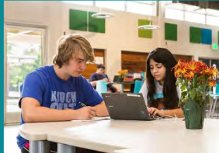
Unschool Alternative Learning Center