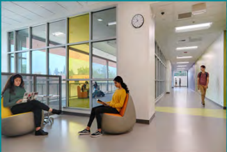
Arden Middle School