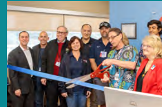
Educational & CTE Pathways