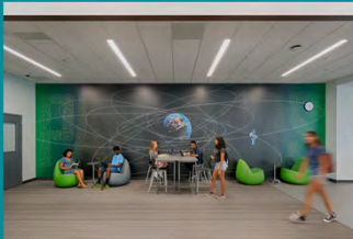
Arden Middle School