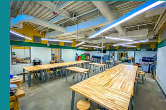
Rio Americano High School CTE