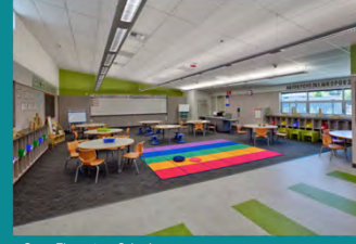
Greer Elementary School