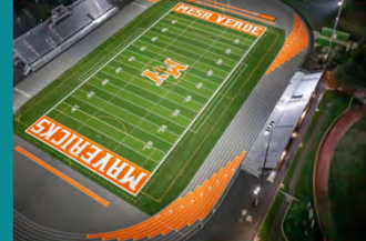
Mesa Verde High School