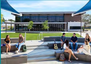
Casa Roble High School Student Union and Administration