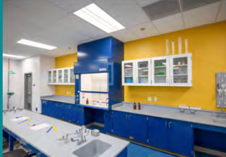
Del Campo High School Science, Media Commons & CTE Building