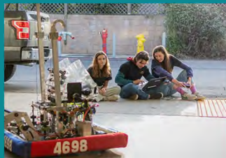
Rio Americano High School CTE