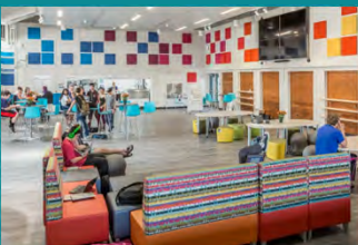
Unschooled Alternative Learning Center