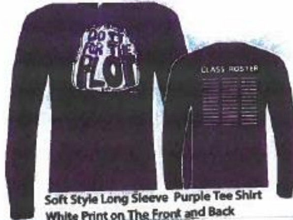
Soft Style Long Sleeve Purple Tee Shirt White Print on The Front and Back

The names of the seniors will be listed on the back of the shirt.