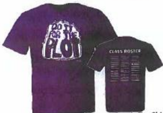
Soft Style Short Sleeve Heather Purple Tee Shirt White Print on The Front and Back

Long Sleeve Circle size: S M L XL XXL XXXL ($25.00 EACH) $ _____