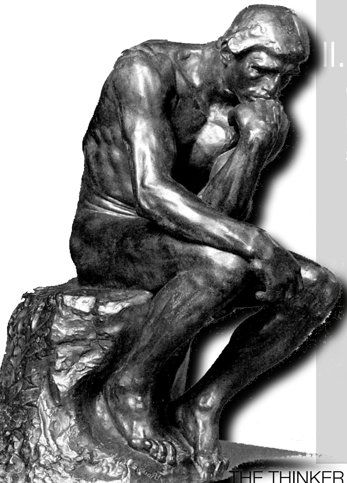
THE THINKER - RODAN