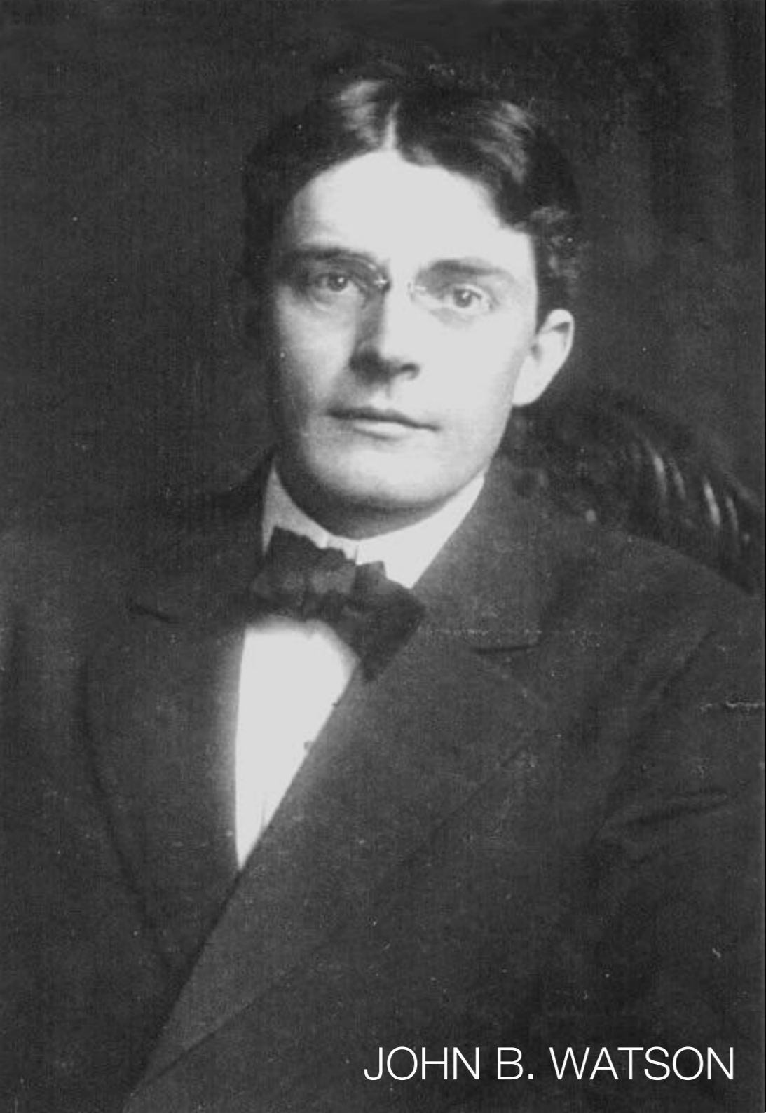
JOHN B. WATSON