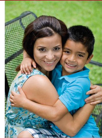
Parents' Guide to:

715 West Platte Avenue Fort Morgan, Colorado 80701 Phone 970-867-5633 Fax 970-867-0262 www.morgan.k12.co.us