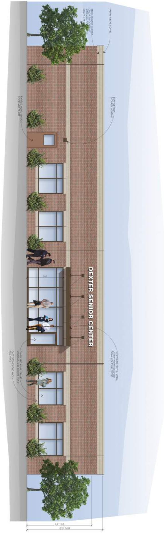
EAST ELEVATION Scale: 1/8" = 1'-0"