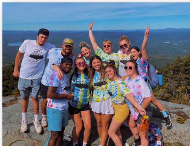
See you at the peak of Mount Kearsarge on Mountain Day 2023!

https://colby-sawyer.edu/student-activities/mountain-day