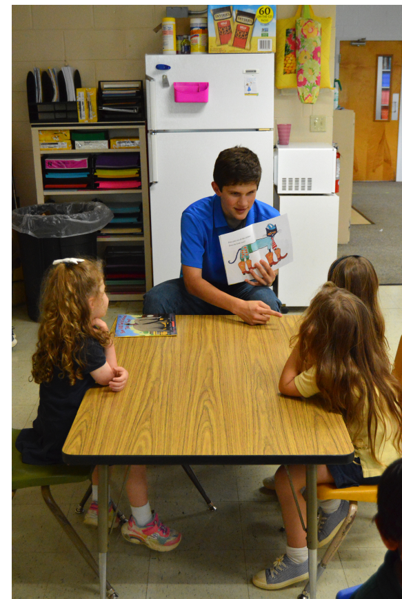
8th Graders are leaders in our school