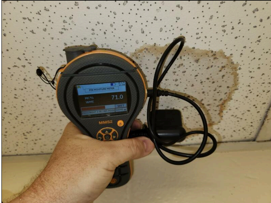
13 - Wet ceiling tile in Room 106 bathroom