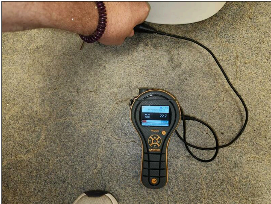
16 - Elevated moisture meter reading collected from the base of the toilet in the Room 104