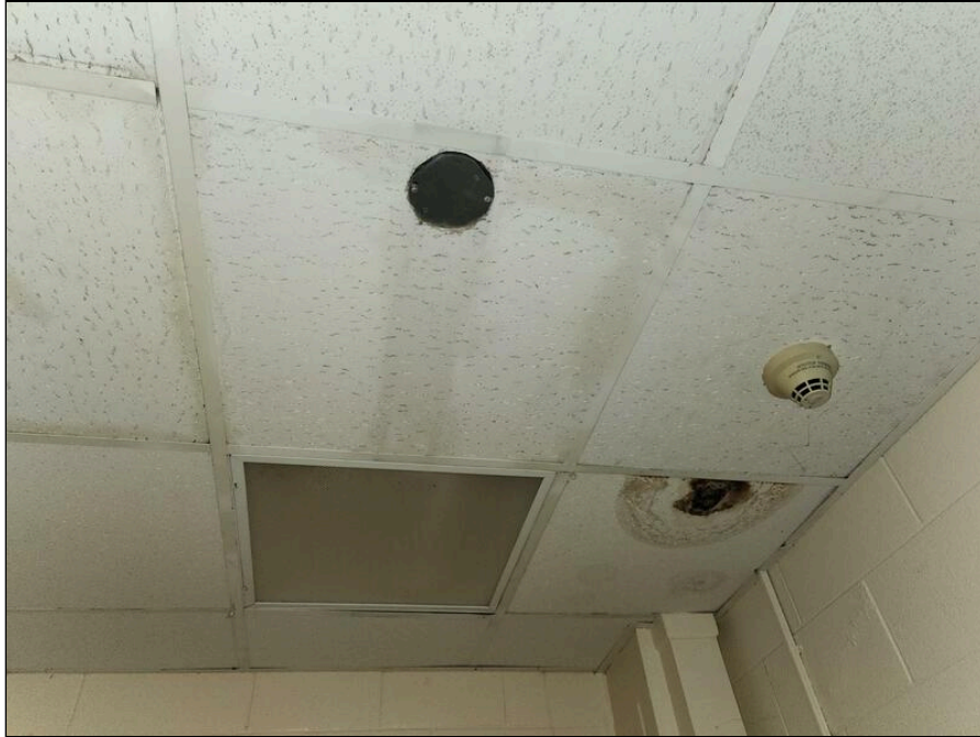
7 - Mold and water impacted ceiling tiles above exit near room 110