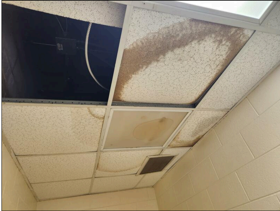
1 - Water and mold impacted ceiling tiles in the Conference Room/Locker Room