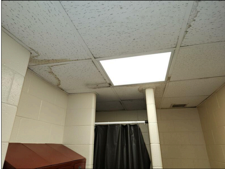
15 - Mold and moisture impacted ceiling tiles in the employee locker room