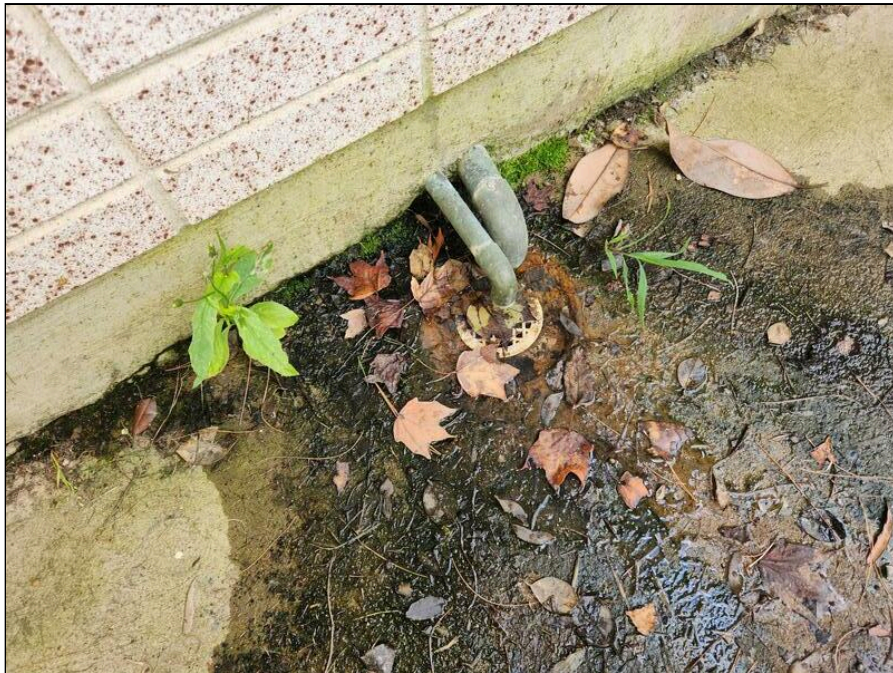
6 - View of overflowing condensate drain