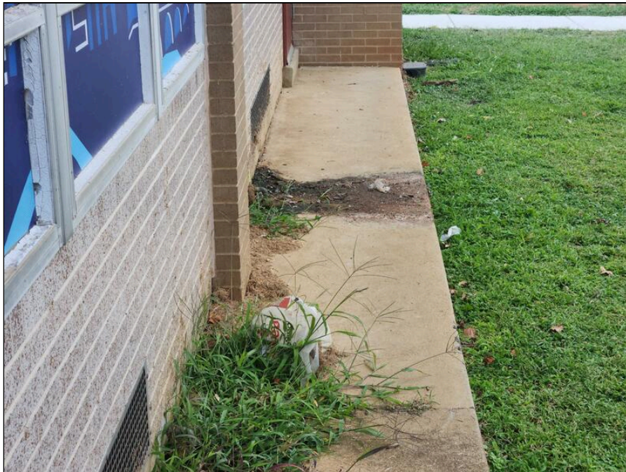
4 - Fan coil condensate backing up outside the classrooms