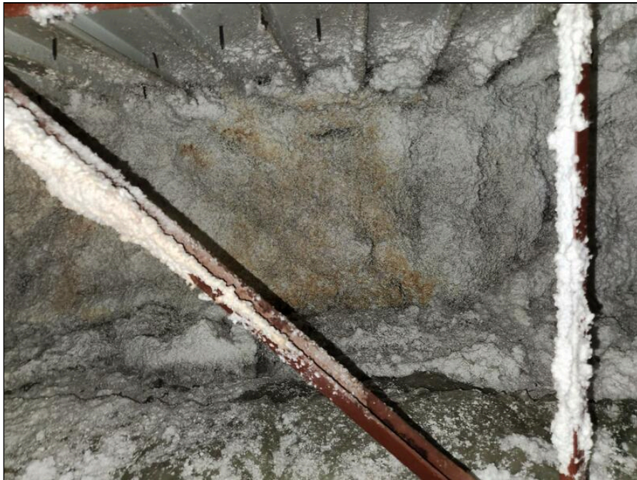
8 - Discolored blown in Soffit insulation in room 112