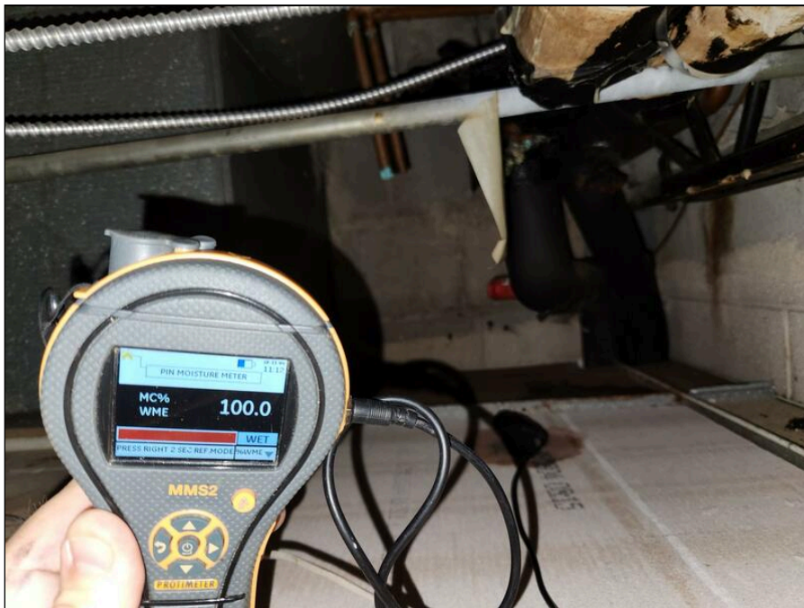
12 - Wet moisture meter reading and active hydronic plumbing leak in Room 104