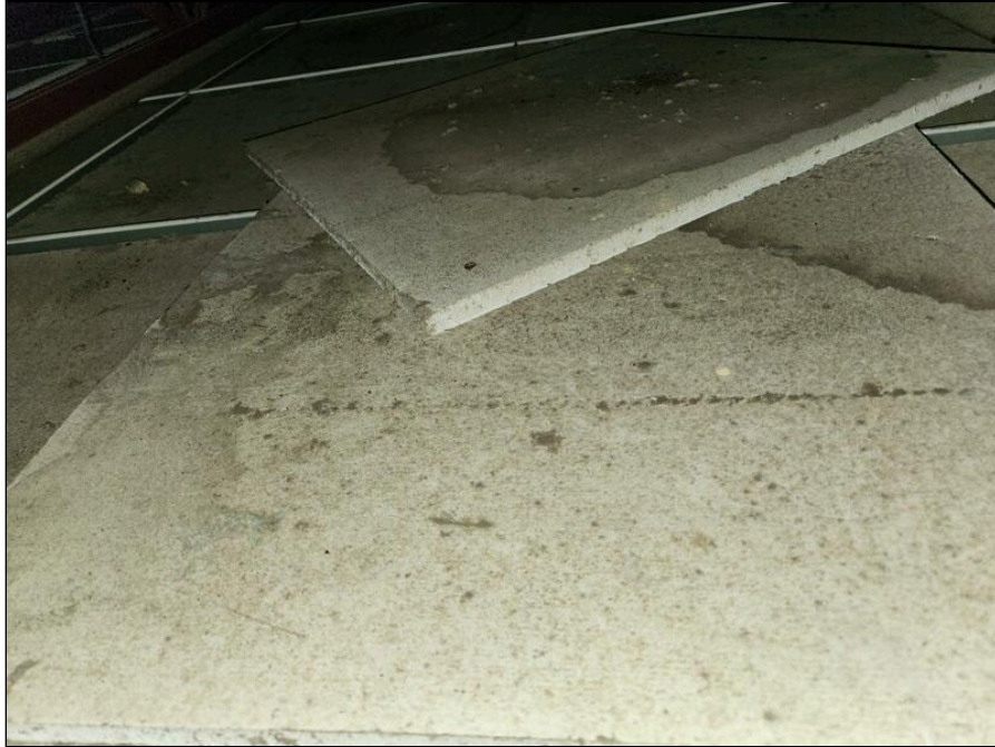
9 - Visible evidence of mold on the back of the older ceiling tiles in Room 113.