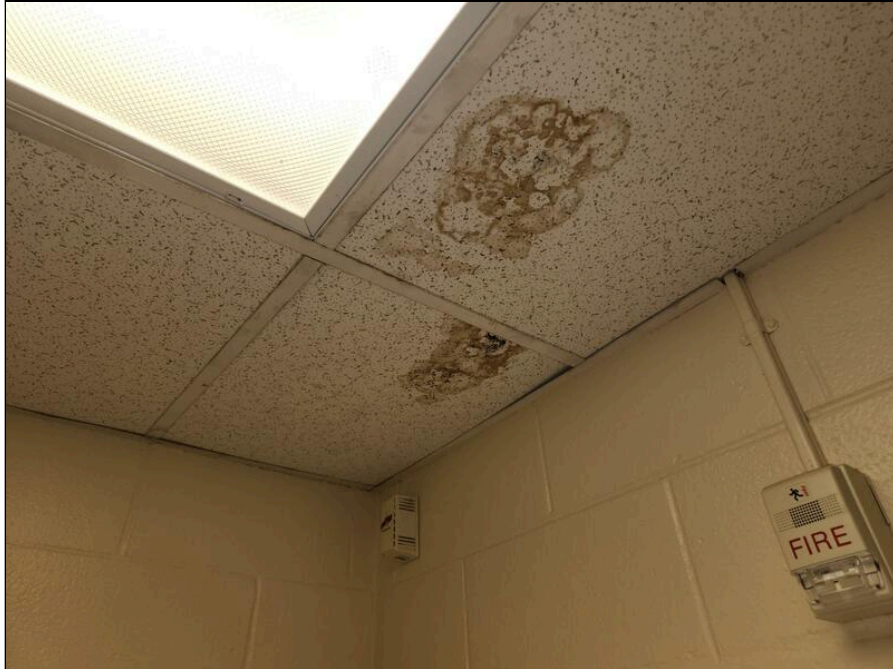
11 - Water and mold impacted ceiling tile in the Room 108 bathroom