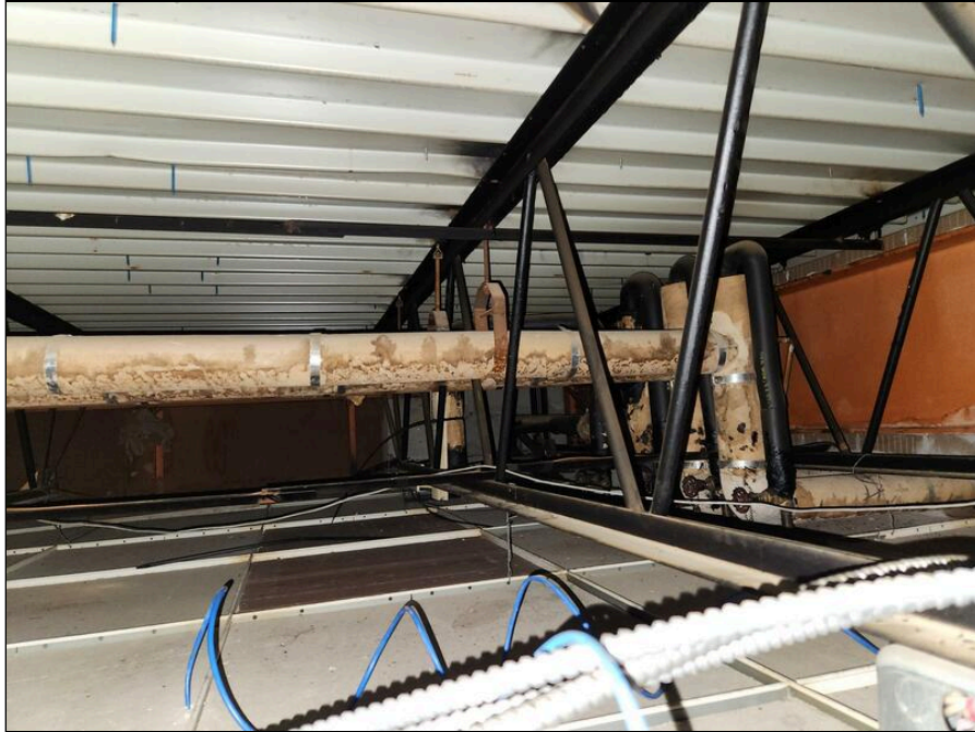
3 - View of mold impacted fan coil loop insulation above the faculty lounge