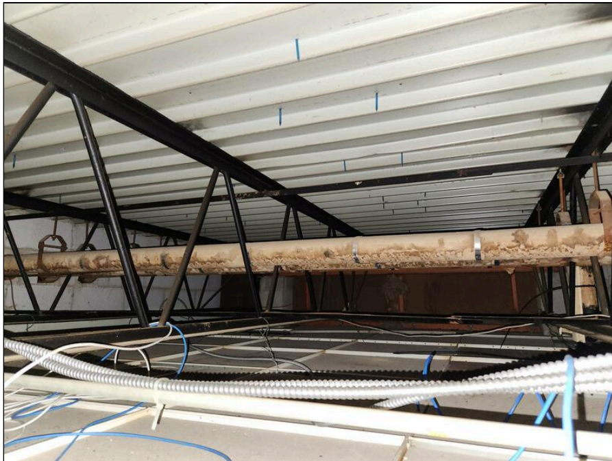
2 - Mold and water impacted insulation on the fan coil loop plumbing in the Faculty Lounge