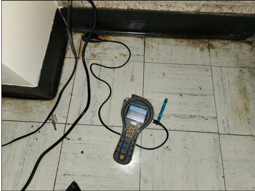
5 - Staining on floor tile and elevated moisture meter reading in room 112