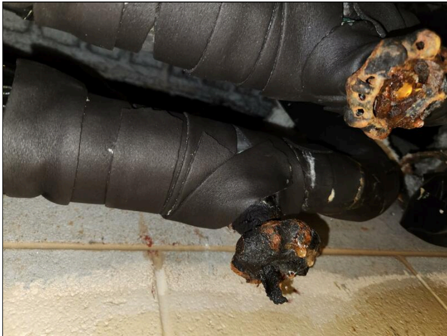
14 - Source of leak in Room 106 Bathroom