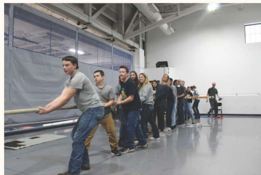
Students from Farristown Middle School prepare to face off against Madison Southern AFJROTC Cadets in a tug-o-war battle. Each group of visiting students from both schools begin their AFJROTC tour by participating in this fun event.