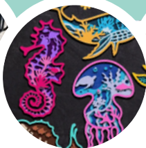
WEEK 2 SUN, SURF & SEA