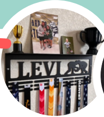
WEEK 1 ALL-STAR SPORTS