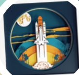
WEEK 4 OUT OF THIS WORLD