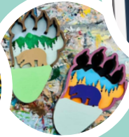
WEEK 3 ADVENTURE AWAITS