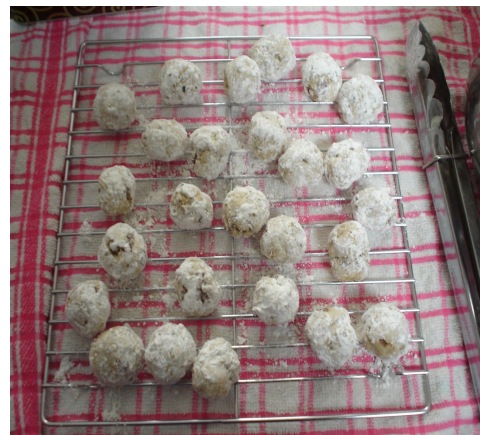
FREE STOCK PHOTO

up and pick a present. Once the last present is taken, a five minute timer is set and the rolling continues. If you roll the numbers mentioned above you are allowed to go steal a present from another player. This is the aspect of the game that makes it competitive. My family has played this game every Christmas Eve ever since I can remember. My family is very competitive so things get a little crazy at this time. We all usually have our eye on one present and people steal it back and forth until the timer runs out. Once the five minutes are up everyone stops and we start opening the gifts. The presents can cost any amount of money, so some presents are very nice, some are presents that were in the game last year that got put back in as a joke, and some of the gifts are hilarious. Everyone in my family is a good sport about what they get and we all laugh about it together. One year my cousin's grandpa got a pair of women's underwear. We all had a good laugh about it and he took it like a champ. My family plays with about 20 people each year, but you can play with more or less. If you try this game out I hope you and your family have a lot of fun with it! I hope everyone has a Merry Christmas and happy New Year!