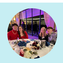
Dancing the night away Sneak Peek at the 2023 Winter Semi-Formal article in the winter paper