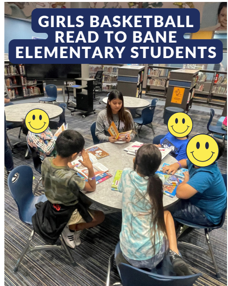
GIRLS BASKETBALL READ TO BANE ELEMENTARY STUDENTS