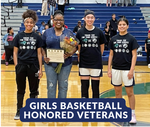
GIRLS BASKETBALL HONORED VETERANS