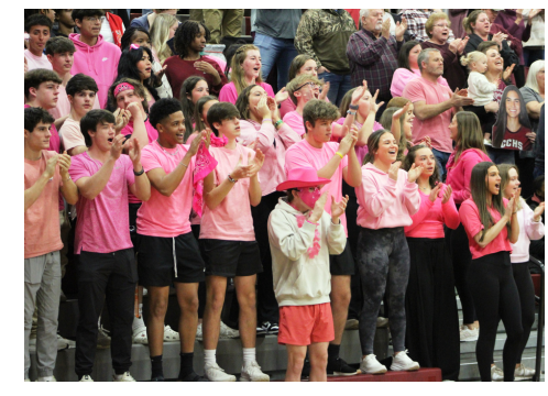
Above: Crockett's Cavalier Crazies were pinkedout for the championship game, loudly supporting their Lady Cavs.

The District 13-AAA Tournament boys' action concludes Tuesday night in Alamo with Obion facing South Gibson for third place at 6:00 and Dyersburg tangling with Dyer County for the championship at 7:30.