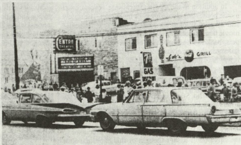
1958 Saturday Matinee

"The Movies" is our subject and they were a huge part of nearly every kid's life during the 40s and 50s.