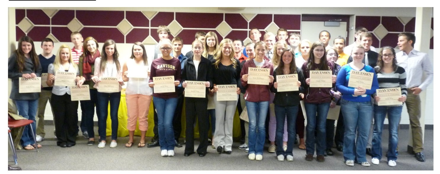
Student athletes attend Monday night's Board of Education meeting to receive their All Academic certificate.