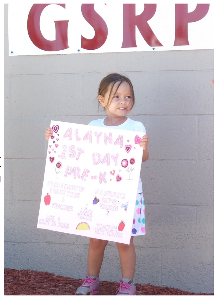
A student on her first day of GSRP in September.

Other early childhood programs that are available include Successful Kids = Involved Parents, more commonly known as SKIP. The free program for students ages 0-5 and their parents encourages group play and parent education. Play groups are held at Central Elementary once a month and home visits are also available for parent educators to perform developmental screening to help identify students who may need speech or other services.