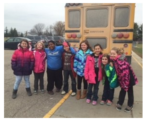
These Gates Elementary students were in charge of organizing and tallying the donated items at their school.

you to our students, staff, parents and community for supporting this initiative. We heard about some pretty friendly competitions among classrooms and we appreciate your generous and spirited donations!