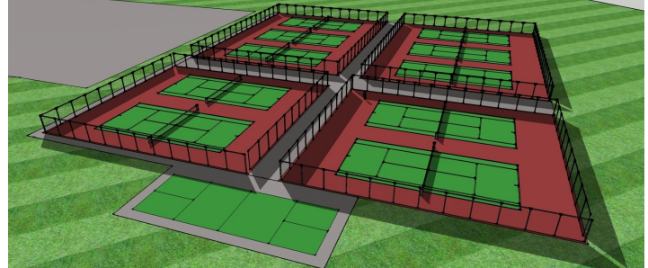
A conceptual drawing of the tennis courts by architects Kingscott Associates, Inc.

The plan calls for a new 10-court tennis facility, upgrades to the existing soccer building and plans for a renovated and permanent marching band practice