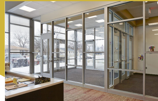
Secure Entry Examples