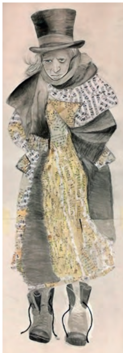
Artwork by our talented Year 9 Art Scholars

This term the Year 6-8 Scholarship group have been producing work based on current events such as the Queen's passing and Remembrance Day. In the run up to Christmas, they will be responding to a more festive theme by creating snow globes! Within these projects they have been able to explore their interest in a variety of media and have had their work displayed the Art Department to inspire others in the school.