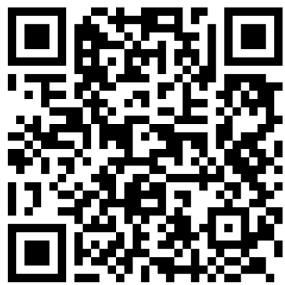
EVENT VIDEO OF DRUMMING

We, acknowledge and respect: Seabrook Community, Quinault Pride, Bezos Academy, Jump Party Rentals, Pacific Beach Early Steps Program, Quinault Wellness Garden, BySimplyUs, QIN Sacred Healing Journey Program, Pacific Beach Parent Committee and the Quinault Language Department.