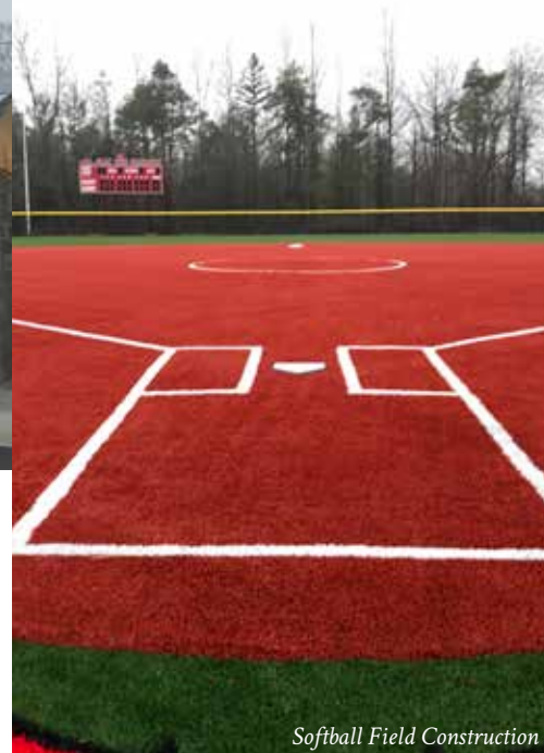
Softball Field Construction

Work continues throughout the district as part of the 2017 voter approved capital project. Projects include the construction of a new softball field with a turf infield at the high school and resurfacing of gym floors at Pal-Mac Primary and Intermediate Schools. Work on an updated concession stand and storage facility near the football field is ongoing as well.