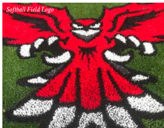
Softball Field Logo