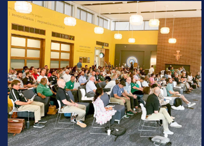
Professional Development: $15,000

To support Cathedral's AI initiatives, visit gocathedral.com/fundaneed