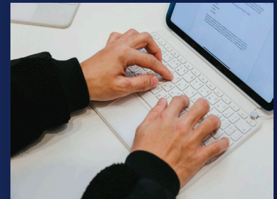
Ed Tech Coach & Innovation Budget: $25,000