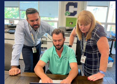
Educational Technology Coach: $80,000 salary and benefits package