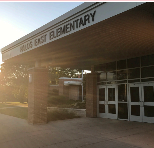
Palos East EXEMPLARY SCHOOL 2020

This proposed tax shift requires voter approval. To learn more about the referendum, please visit www.Palos118.org/referendum