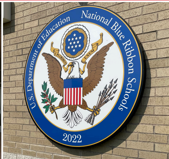
Palos West BLUE RIBBON SCHOOL 2022