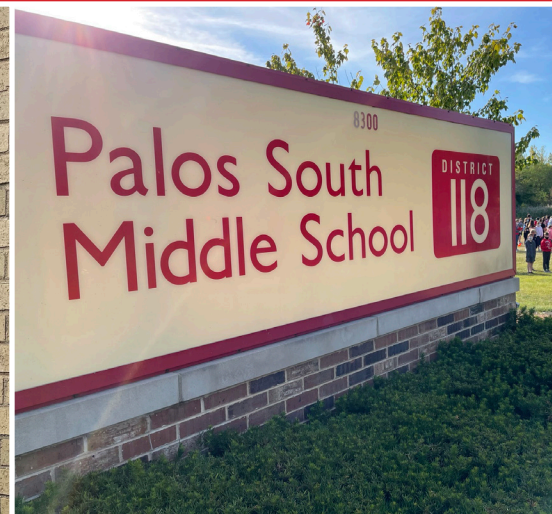
Palos South EXEMPLARY SCHOOL 2023